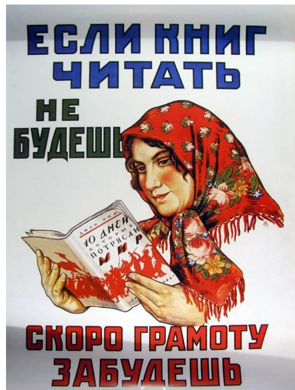
“If you don’t read books, you will soon forget how to read.” Book: 10 Days that Shook the World by John Reed, about the October Revolution Ed2008.1.8 (reproduction)

spread the revolutionary fervor and build a new society: Izvestia , the highest-selling Communist newspaper, had a high circulation of 400,000 copies, while Pravda reached barely a third of that number. 10 The Bolsheviks’ response to this dilemma was the propaganda poster. Political posters, following the example of the traditional Russian Orthodox icons, “could present symbols in a simple and easily identifiable way, even to barely literate peasants.” 11 In the early years of the Soviet Union, propaganda posters were used to spread literacy while at the same time indoctrinating the masses in Marxist-Leninist thought.